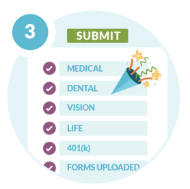
Submit your enrollment, including any required forms (all electronically!)